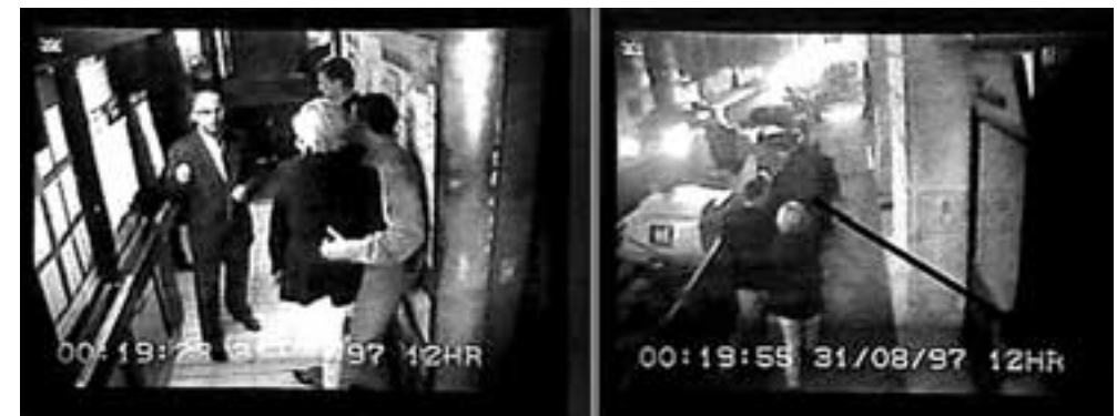
Plate 3 THE APPOINTED PERSONNEL ARE ALSO THERE: THE LUCKY (AND BELTED) BODYGUARD AND THE DRUNK FRENCHMAN.

The vehicle does not roll over, probably cut from the roof by avoidability. The windshield and the roof collapse. The grill of the Mercedes is pushed back into the front seat. The Princess of Wales reaches in to feel the peak of dynamic crush caressing it, sunning herself in the initial impact to the point of maximum time. Acceleration that would have been experienced by the chest is about 70 times the force of gravity (70 g's), or about seven times what a fighter pilot experiences. The